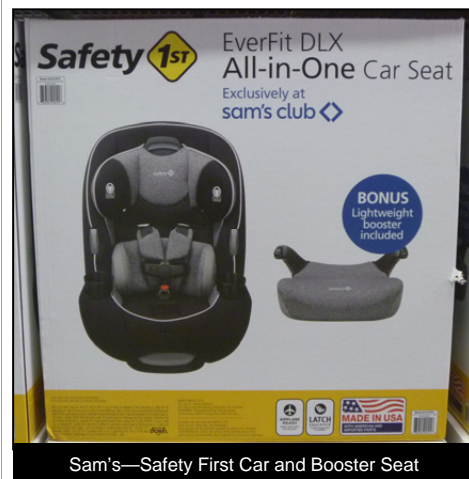
Sam's—Safety First Car and Booster Seat

Baby Food, Supplies – The baby selection at Sam's included the following exclusive item: a Safety First EverFit DLX all-in-one car seat with a bonus booster seat for $114.98 (see picture on the left).