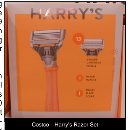
Costco—Harry's Razor Set

HBA – Costco's HBA selection included a 15-count Harry's razor set with a Truman razor, 13 cartridges and a travel blade cover for $24.99 (see picture on the right). All three clubs stocked a variety box of Band-Aid adhesive bandages. BJ's and Sam's stocked the same package: a 173-count box that included 25 skin flex bandages, 30 water block bandages and 118 flexible fabric bandages (a 100-count box, a 10-count box and an eight-count travel pack) for $10.98 at Sam's and $10.99 at BJ's or 6.3-cents per bandage. Costco stocked a 188-count box that included 30 water block bandages, 20 tough strip bandages, 20 water block tough strip bandages, 118 flexible fabric bandages (a 100-count box, a 10-count box and an eight-count travel pack) and a bonus travel case for $12.99 or 6.9-cents per bandage.