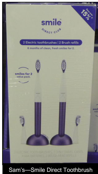
Sam's—Smile Direct Toothbrush

Other oral care SKUs included: a 180-count package of Gum advanced gum care picks with six on-the-go bonus picks from Oral B for $12.99 (Costco), two 33.8-ounce bottles of TheraBreath mint oral rinse for $24.98 (Sam's), a sonic fusion 2.0 water flosser that will brush and floss at the same time with a travel case, five brush heads and five brush head covers from Water Pik ($149.98 at Sam's and $149.99 at Costco), a set of two Gleem battery toothbrushes with four brush heads and two travel cases for $39.98 (Sam's) and a box of two battery toothbrushes with four brush heads, four AAA batteries and two travel cases from Smile Direct Club (see picture on the left) for $44.98 (Sam's).