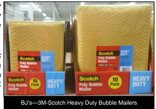
BJ's—3M-Scotch Heavy Duty Bubble Mailers

Costco's alcohol assortment included: a case of twenty-four 12-ounce cans of Kirkland Signature hard seltzer (six cans each of mango, grapefruit, black cherry and lime) for $20.99 and a case of twelve 250-milliliter bottles of Kim Crawford sauvignon blanc from New Zealand for $45.99.