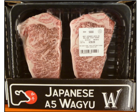
Costco – Wagyu New York Steak

The issue of quality is so central to Costco's purchasing decisions that buyers are rarely concerned with price point until they are satisfied a product will meet their members' expectations. With such a focus on quality, the first step a manufacturer should take before approaching Costco is to truly assess whether their product is distinguished from a quality perspective in comparison to competitive products.