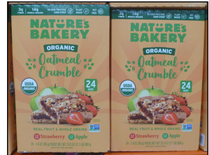
Costco – Nature's Bakery Organic Crumbles

Today, Costco's organic business generates approximately $4 billion in sales annually (see picture on the right of Nature's Bakery organic oatmeal crumbles). Costco's focus on organic merchandise has grown over the past few years due to six benefits it accrues from these items: