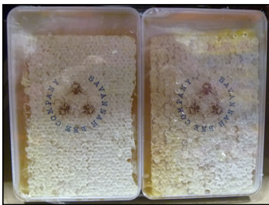
Costco – Savannah Bee Honeycombs

One of Costco's key buying strategies is to constantly “push the envelope” in terms of its product assortment (see picture below of a package of two Savannah Bee honeycombs). A non-food vendor said, “Costco’s buyers have full authority to do what they want. They’re given freedom to make mistakes.”