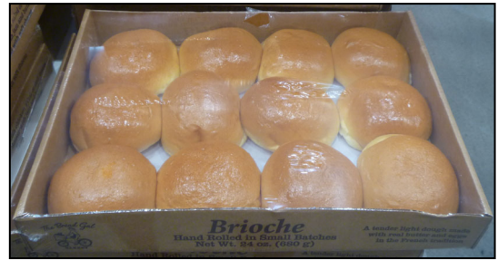
Costco – Bread Girl Brioche Buns

Costco's fresh food departments (meat, bakery, produce, deli and prepared foods) are an important part of its business model. Not only is sales growth robust with fresh food comparable sales consistently among Costco's strongest but the departments help to increase member shopping frequency (see picture on the right of a package of Bread Girl hand rolled brioche buns).