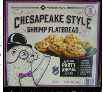
Sam's—Member's Mark Flatbread

Mark for $10.98, eighteen 0.6-ounce lobster crostini from Member's Mark for $9.98, fortyeight 0.75-ounce mini quiche (24 each of ham Swiss cheese and spinach Swiss cheese) from Member's Mark for $10.98 and sixteen 0.75ounce Chesapeake-style shrimp flatbread from Member's Mark for $9.98 (see picture on the right).