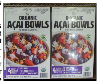
Sam's—Organic Acai Bowls

Some of the unique breakfast products included: eight 3.9-ounce three cheese omelets from Eggland's Best for $12.48 (Sam's), eight 5.05-ounce Jimmy Dean egg, ham and cheese sandwiches on sourdough bread for $12.48 (Sam's), six 6-ounce breakfast stromboli's with egg, sausage and cheese from Leonetti's for $12.98 (Sam's), twelve 3ounce egg white flatbread sandwiches with turkey sausage for $9.98 (Sam's), six 6.25ounce Tattooed Chef organic acai fruit and granola bowls for $12.59 or 33.6-cents per ounce (Costco), four 8-ounce Tattooed Chef organic acai fruit and granola bowls for $10.48 (see picture on the right) or 32.8-cents per ounce (Sam's) and a 72-count case of Wellesley Farms French toast sticks for $7.99 (BJ's).